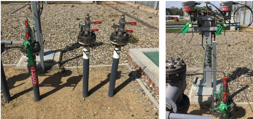
Figure 3: Perenco A1 Incomer Stabbings and Pressure Switches

5.12. Additional pressure stabbings are also being installed to Perenco A2 incoming line which will mirror the revised arrangement on the A1 incomer with the addition of a third pressure sensor as shown in Figure 3.